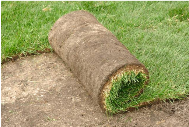
Cultivate a Green Patch in your Brownfield

The more time you spend in a brownfield, the better a green patch looks. By focusing on a single new line or cell, it can be much easier to get started with an initial deployment, learning how to apply IIoT in a controlled environment and scale, with new technologies designed for the task. The 'green patch' is intended to propose a readily accessible approach for mid-market manufacturing enterprises to obtain the advantages of IIoT without becoming overwhelmed by a large-scale rollout.